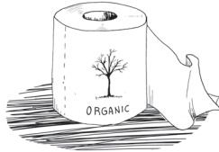
Organic Toilet Paper